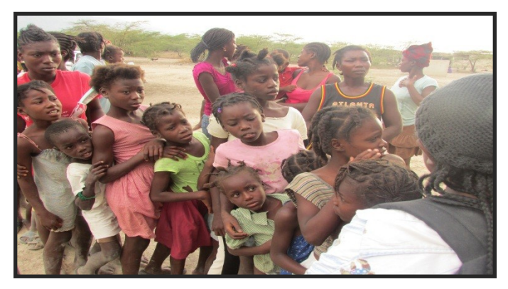
Haiti Mission Children

54<sup>th</sup> National Foreign Mission Convention May, 2014 Tupelo, Mississippi